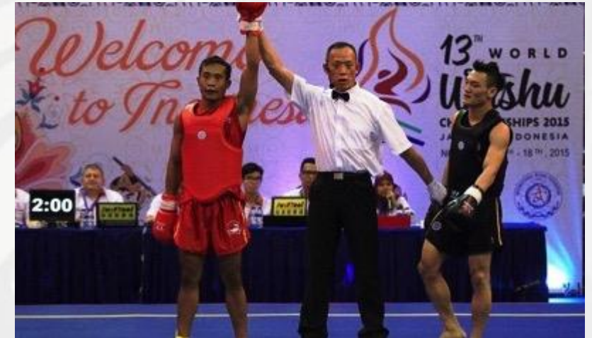
Developing High Achiever Students