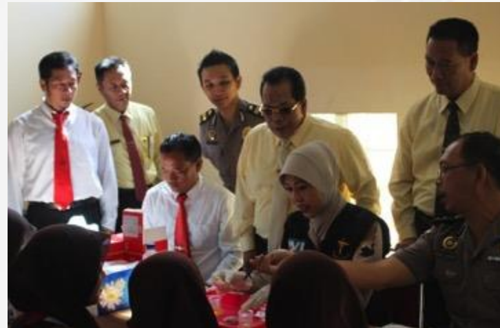
Compulsory Drug Test