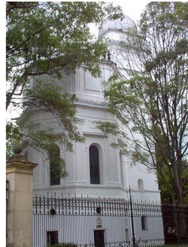
National Astronomical Observatory