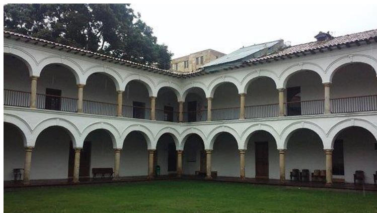
San Agustín cloister