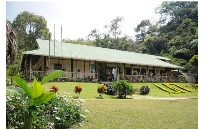
Yotoco National Forest Reserve