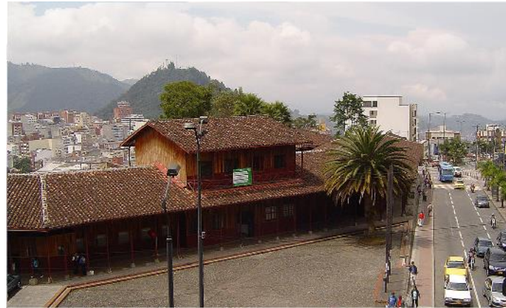
El Cable campus - Manizales