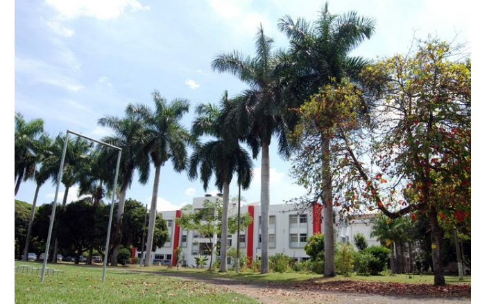
Palmira (main campus)