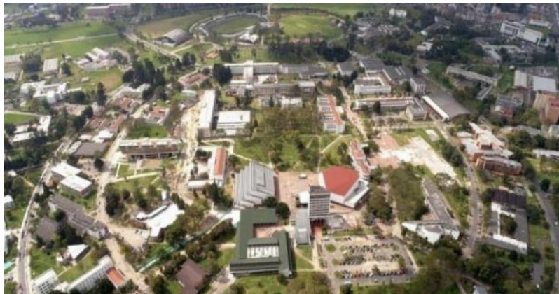
University city or “White city” (main campus)