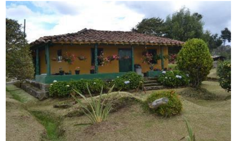
Paysandú agricultural station