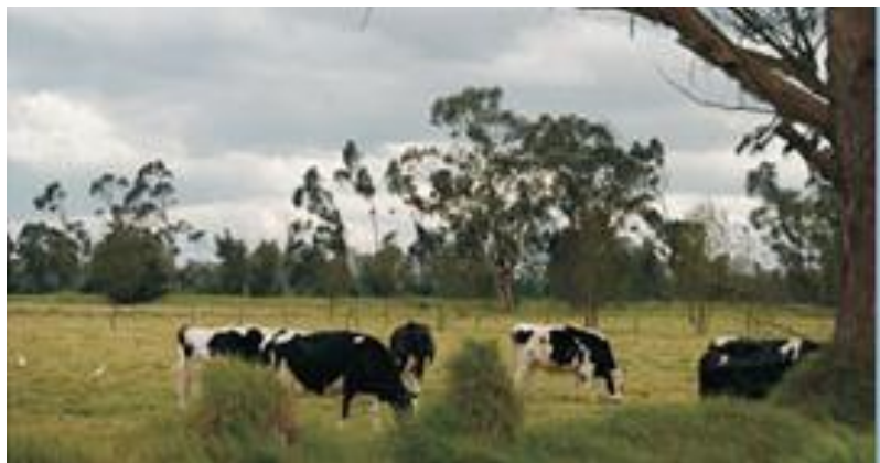
Marengo agricultural centre