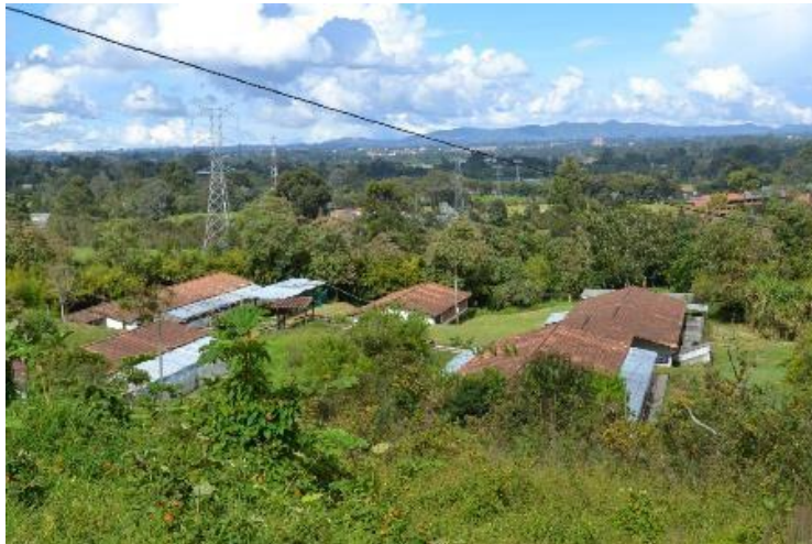
San Pablo farm