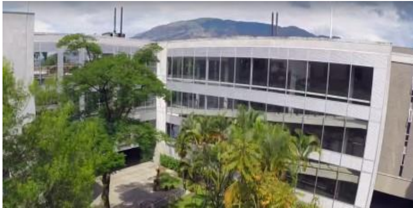
El Volador (main campus)