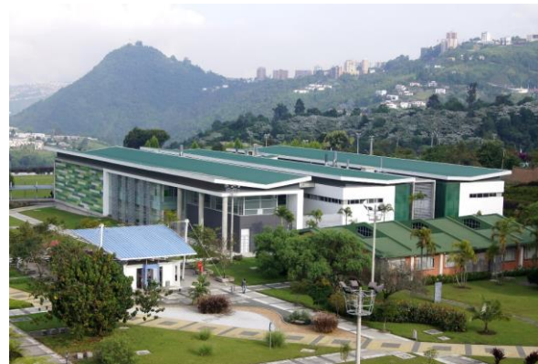
La Nubia campus - Manizales